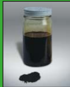
Dirty Power Steering Fluid