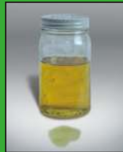
Clean Power Steering Fluid

Fresh power steering fluid is clean and clear. Dirty, neglected power steering fluid can look like used engine oil and can compromise the performance of your steering system, and in some cases, even cause damage. If you haven't serviced your power steering system lately, now's the time to do something about it.